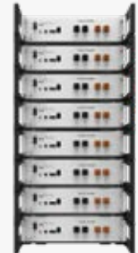
Stacked up to 8pcs with R-Brackets (40kWh in total)