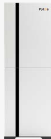
Or Forest R Cabinet