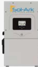
Sol-Ark Hybrid Inverter Series