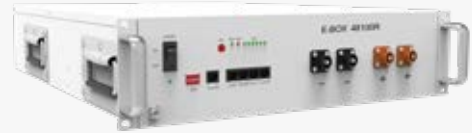
Lithium Iron Phosphate Battery Module E-BOX-48100R (5kWh)