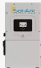
Sol-Ark hybrid inverter